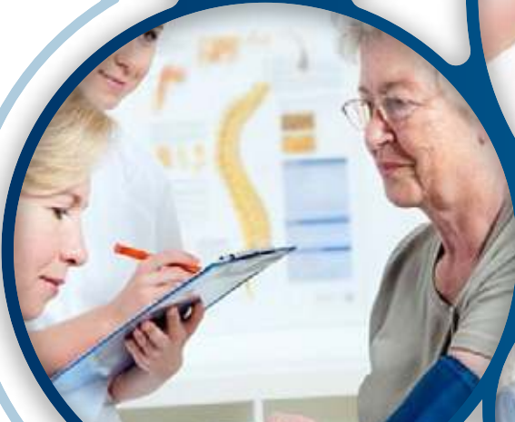
Elderly and Disabled Care